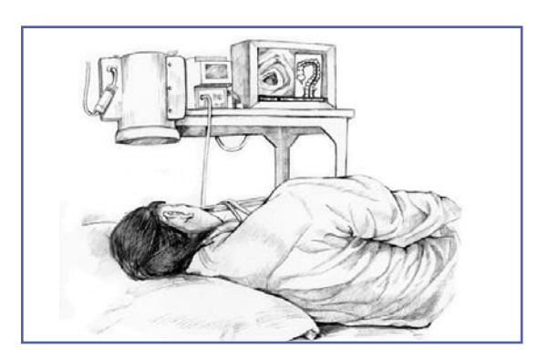
For the test, the person will lie on a table while the gastroenterologist inserts a colonoscope into the anus and slowly guides it through the rectum and into the colon.

For the test, the person will lie on a table while the gastroenterologist inserts a colonoscope into the anus and slowly guides it through the rectum and into the colon. The scope inflates the large intestine with air to give the gastroenterologist a better view. The camera sends a video image of the intestinal lining to a computer screen, allowing the gastroenterologist to carefully examine the intestinal tissues. The gastroenterologist may move the person several times so the scope can be adjusted for better viewing. Once the scope has reached the opening to the small intestine, the gastroenterologist slowly withdraws it and examines the lining of the large intestine again.